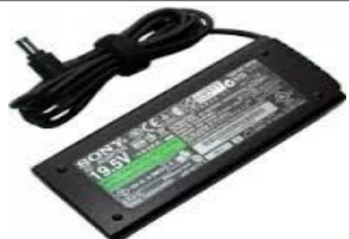
VGP-AC19V36 or 19V41 19.5V 4.7A Looks after 19V13, V14, V19, V20, V26, V27, V28, V31, V32, V33, V34, V35, V36, V37, V41 & V43