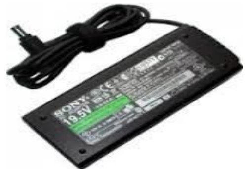
VGP-AC19V36 or 19V41 19.5V 4.7A Looks after 19V13, V14, V19, V20, V26, V27, V28, V31, V32, V33, V34, V35, V36, V37, V41 & V43