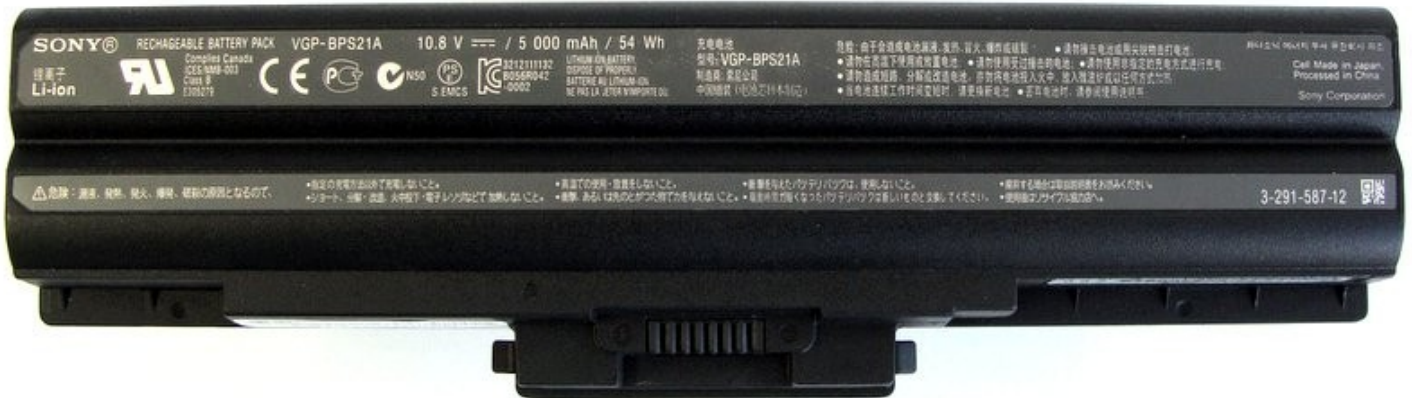
VGP-BPS21 5000mAH (= VGP-BPS13) VGP-BPL21 7500mAH (= VGP-BPL13)