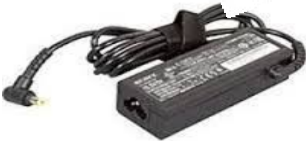
VGP-AC10V10 10.5V / 5V 3.8A USB Socket built in.

**Too many batteries to list, send us an email regarding your unit.